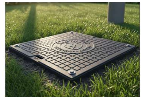
FRP Earth Pit Chamber Manhole Cover