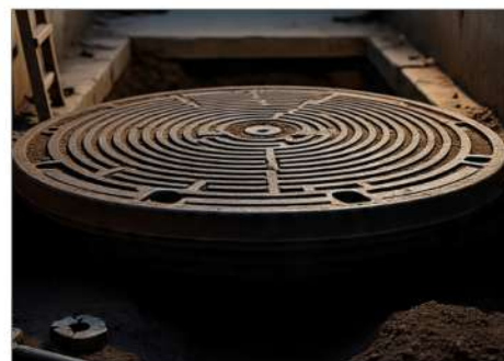
Cast Iron Manhole Earth Pit Cover