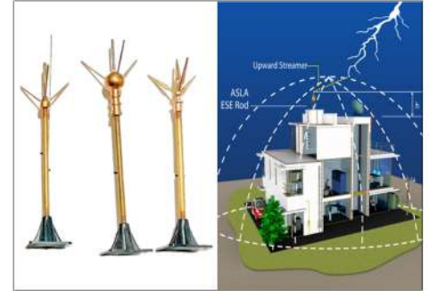
Lightning Arrester and Conductors