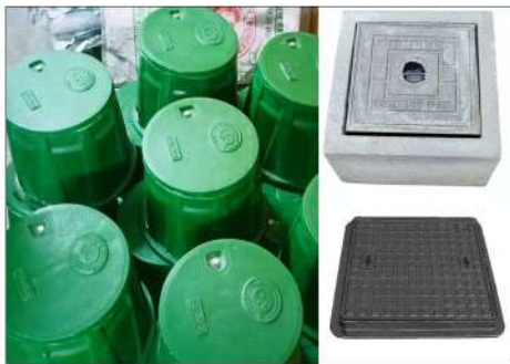
Earth Pit Manhole Chamber Cover