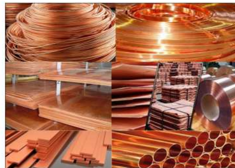
Copper Earthing Strip and Flat