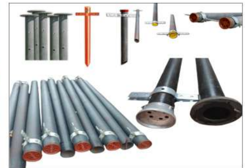
Cast Iron Earthing Pipe and Electrodes