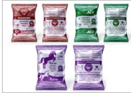
Earthing Chemical Powder