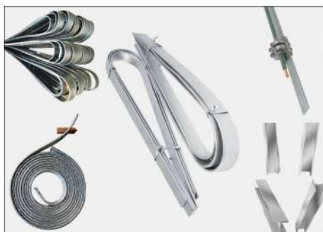
Galvanized Earthing Strip & Flat