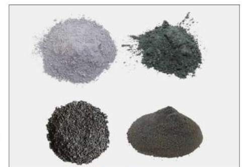
Earthing Powder Maintenance Free