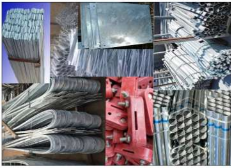
Earthing Strip and Flat