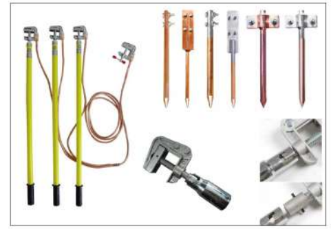
Earthing Rod and Wire