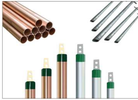
Earthing Pipe and Electrodes